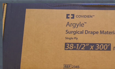
Surgical Roll (Covidien Argyle #2345)